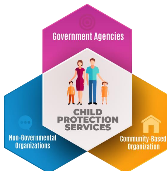
Figure 2 Public Administration Theory of Network Governance

The framework helps identify key issues and challenges in policy implementation and provides a basis for developing recommendations for improvement. Dunn’s framework emphasizes the importance of stakeholder engagement and participation in policy analysis, which is crucial in child protection services, where the involvement of various stakeholders is necessary for effective implementation.